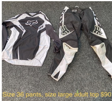
Size 36 pants, size large adult top $90