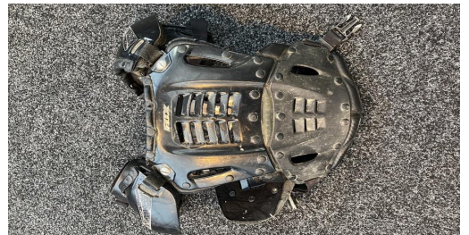
Chest guard for 8-10 year old $30

Lightly used motocross gear in good condition. For more information, contact Bronwyn Stephens at 0274180972