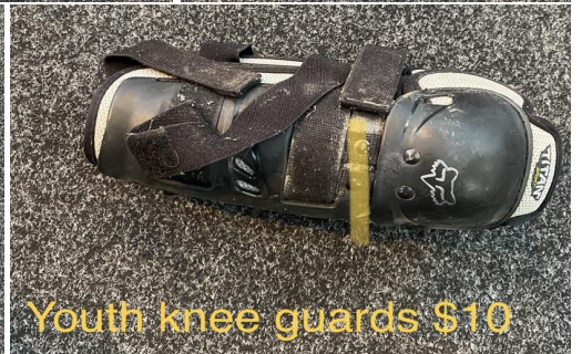
Youth knee guards $10