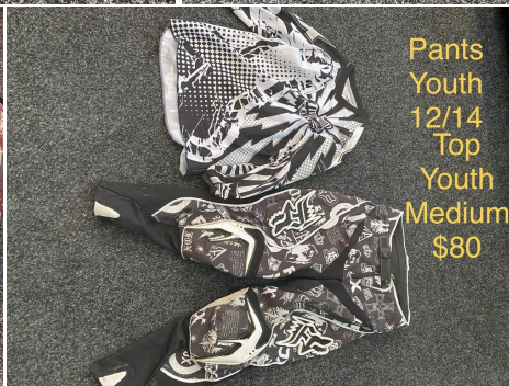
Pants Youth 12/14 Top Youth Medium $80