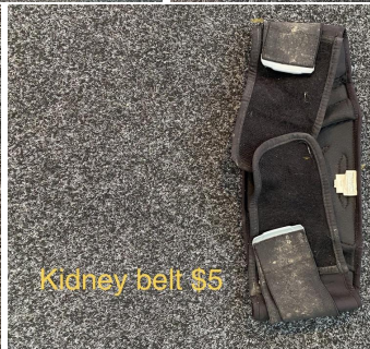
Kidney belt $5