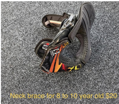
Neck brace for 8 to 10 year old $20