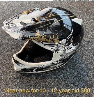
Near new for 10 - 12 year old $80