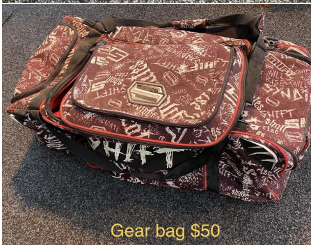
Gear bag $50