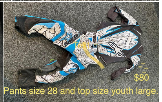
Pants size 28 and top size youth large. $80