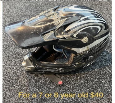
For a 7 or 8 year old $40