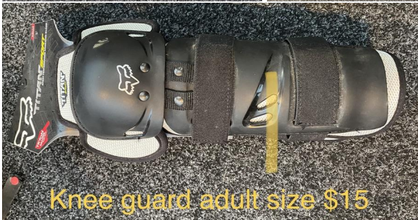
Knee guard adult size $15