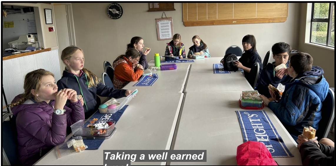
Taking a well earned break