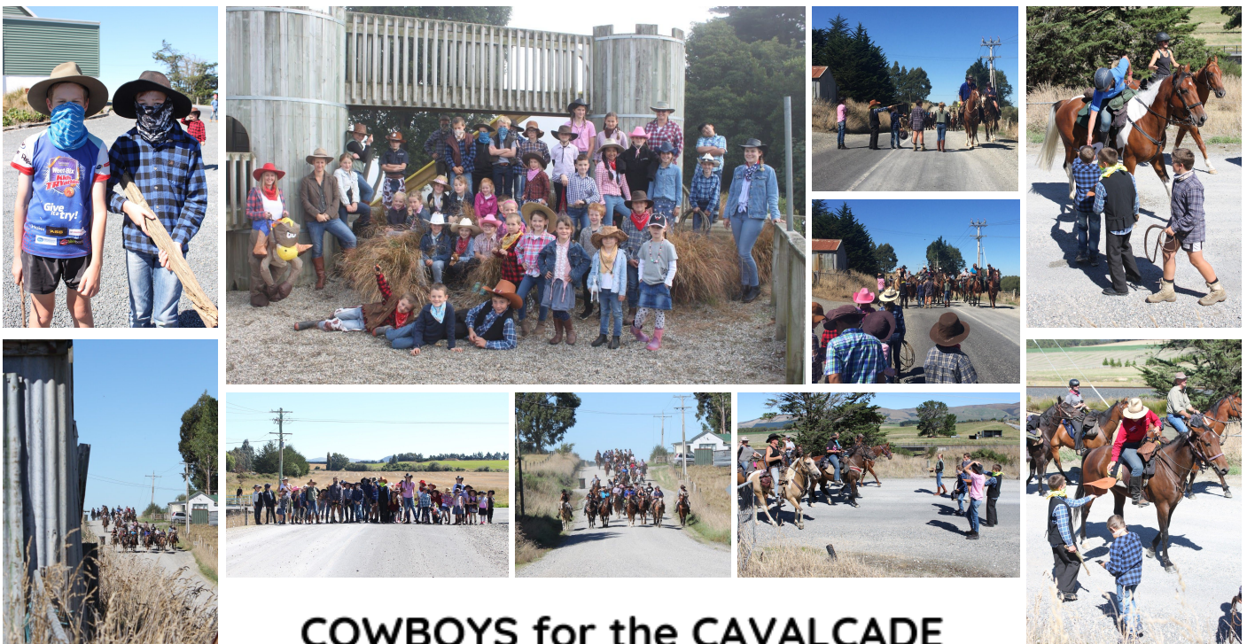
COWBOYS for the CAVALCADE