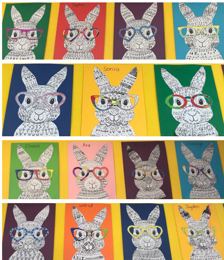
Junior Room Easter Art